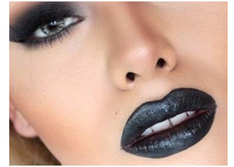
Black or glittery makeup